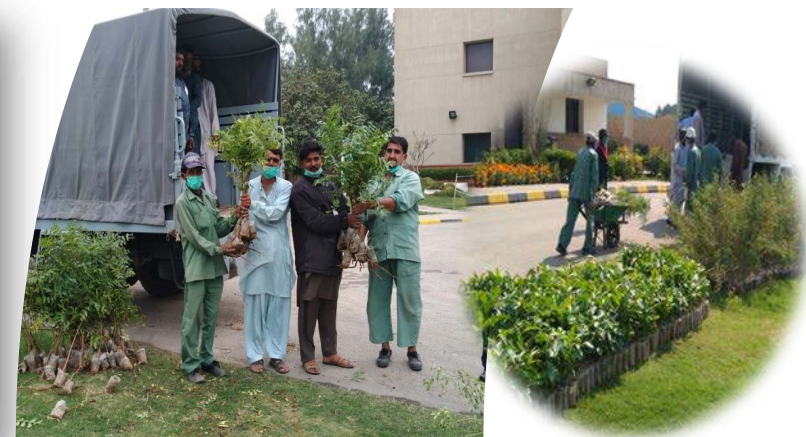
Plants are being loaded in the truck for donation