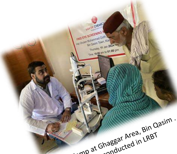
Free Eye Camp at Ghaggar Area, Bin Qasim . 42 Eye Operation conducted in LRBT

Donated 7,000 plants to other organizations to promote tree plantation and reduce the carbon burden on the Earth.