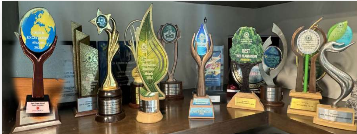
Go Green Initiative – Recognized by the National Forum for Health and Environment.